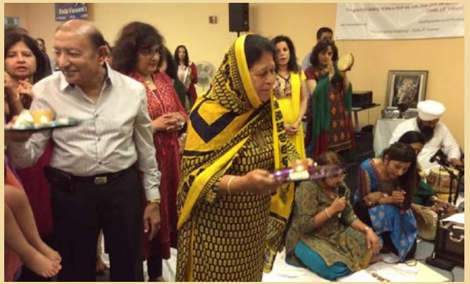
August 2nd- Community Satsang at the Sadhu Vaswani Center