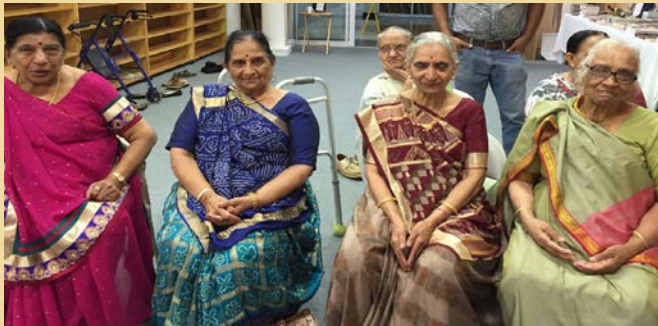
July 30th- Glory to Gurudev with Garba dance with Senior Citizens