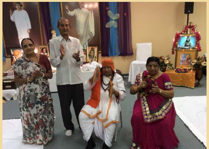
July 29th- Laughing Yoga and Bhajan Antakshari with Senior Citizens