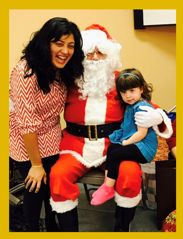
(Continued from the previous page)